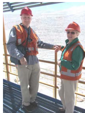
Chuquicamata December 2013