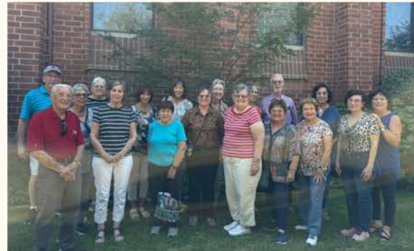
Above: OLLI members gather for a group photo after packing baklava and touring the St. George Greek Orthodox Church.

They and plastic aprons were our wardrobe for our Saturday OLLI adventure to Saint George Greek Orthodox Church. At the church hall about 20 OLLI members appropriately garbed sat at long tables where trays upon trays upon more trays of homemade baklava were delivered to us. Our job was to cut them neatly and evenly and perfectly nestle the correct size pieces ( “does it look like it is worth $3.00”) into paper wraps on another tray, readying them for sale at the Greek Festival the following weekend. Once in a while a sticky finger would grab a broken piece and pop it into our mouth. After a while we were all on a sugar high, laughing and chatting, making time go by quickly.